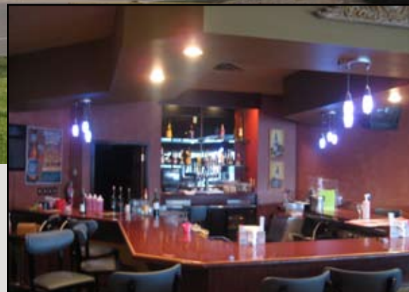
5,000 sf restaurant space available

For Lease 1,000 - 5,200 square feet available Net Rental Rates $14.00 Estimated CAM & Tax $5.88 (2009)